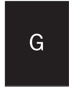
Full Page Color No Bleed: 7.5" x 10" (like "A") or

Bleed: 8.625" x 11.125" (trims to 8.375" x 10.875") Live content 1/4" from trim