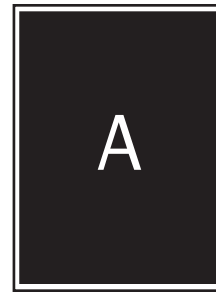
Full page B&W 7.5" x 10"

PLEASE NOTE: Artwork and disks will not be returned. Files not submitted to specifications and/or requiring troubleshooting will incur alterations fees billed at $50 per hour.