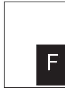
1/4 page B&W 3.5" x 4.75"